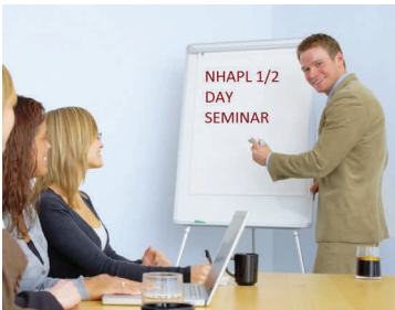
(Not actual event picture*)

Please join us in thanking each of this year's Half-Day Seminar speakers and we hope you enjoyed your afternoon. If you have any questions/comments/opinions regarding future events, please use the "Contact Us" page to give your input.